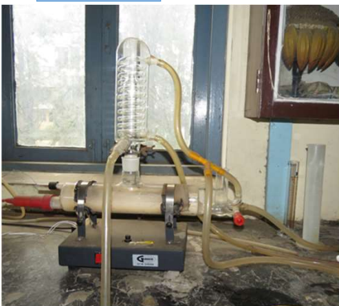
Water Distillation Unit