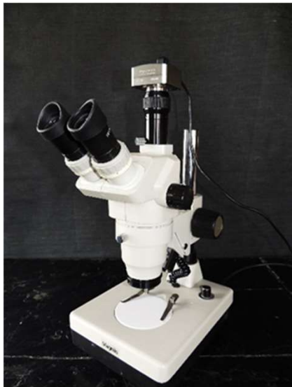
Trinocular Stereo Microscope