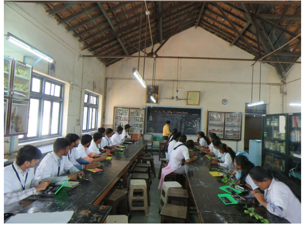
Laboratory No. 2