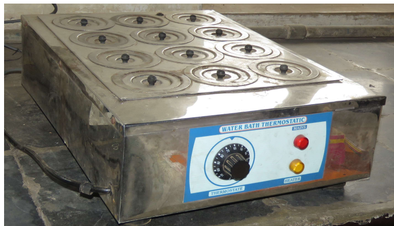
Hot Water Bath