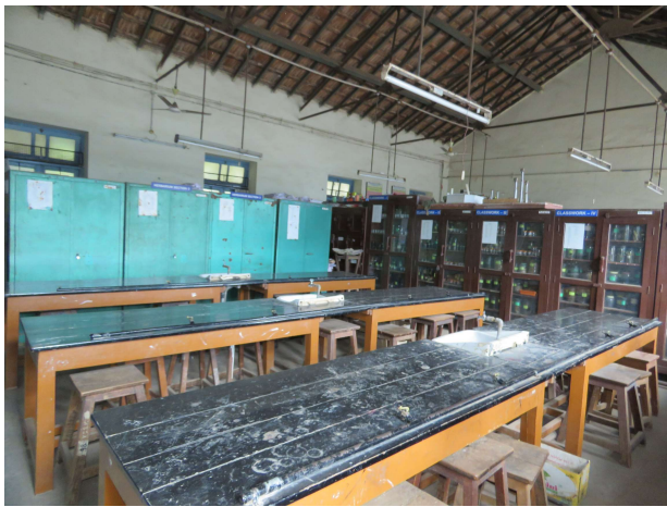
Laboratory No. 3