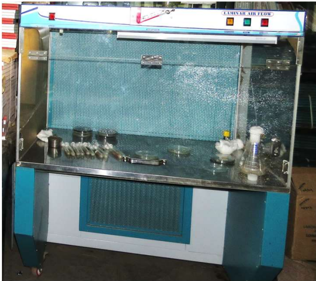
Laminar Air Flow