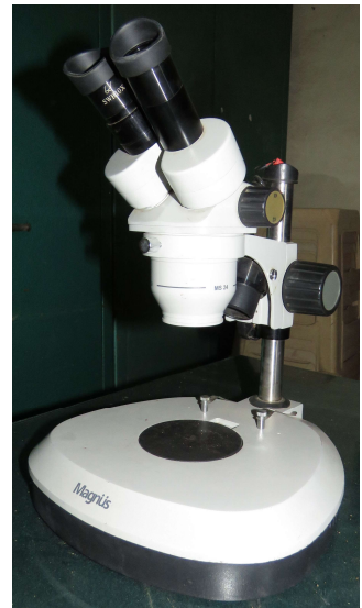
Binocular Stereo Microscope