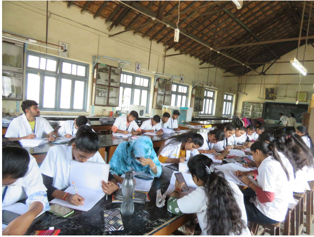
Laboratory No. 1