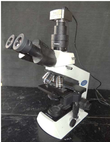
Trinocular Research Microscope