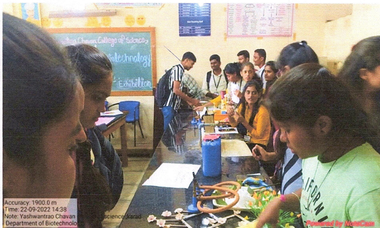
Coordinator Lead College Activity