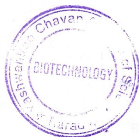
Principal, Yashwantrao Chavan College of Science, Karad