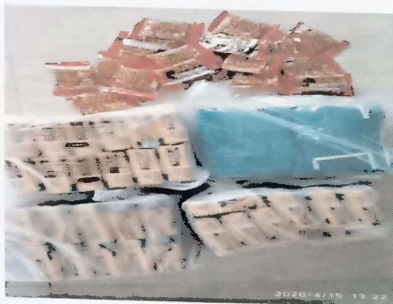
Biscuit, Chiki, Masks etc donate in COVID-19