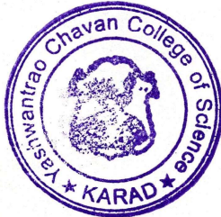
Principal Yashwantrao Chavan College of Science, Karad