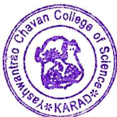
Principal, Yashwantrao Chavan College of Science Karad