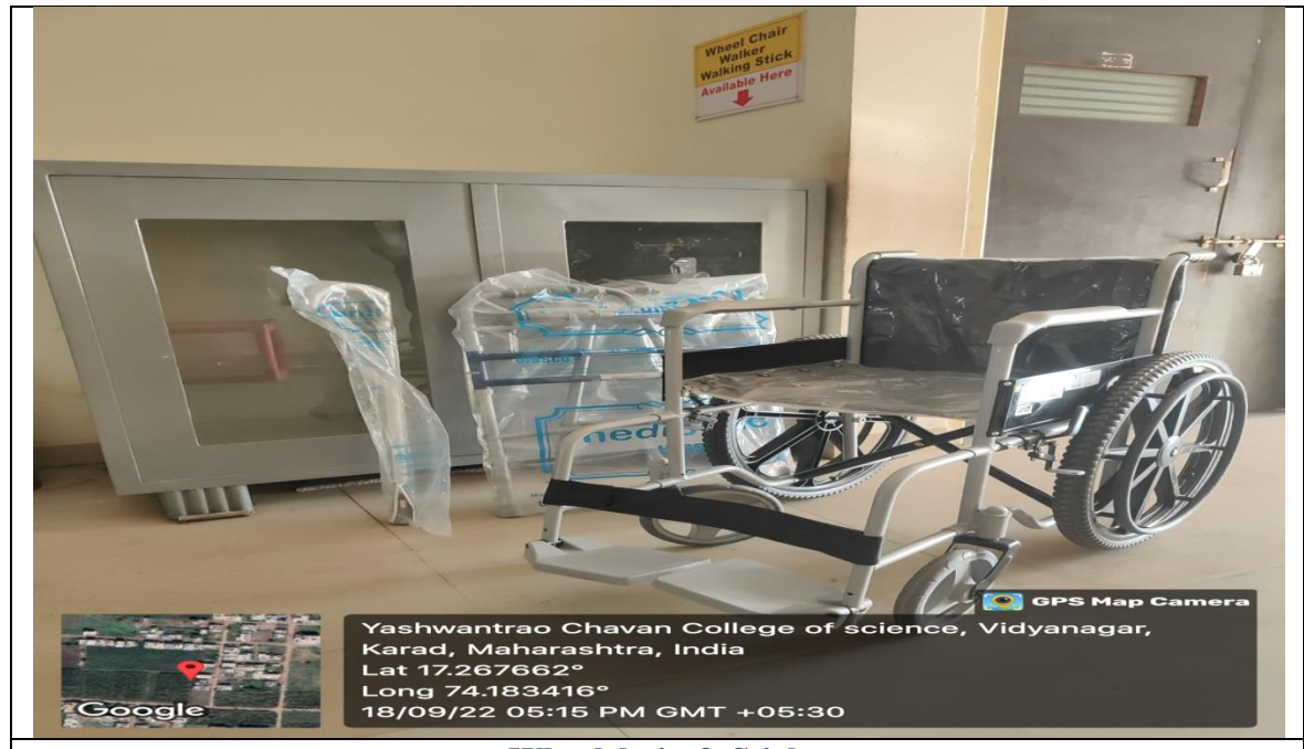
Wheelchair & Stick