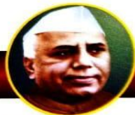
Hon. Yashwantrao Chavansaheb Founder